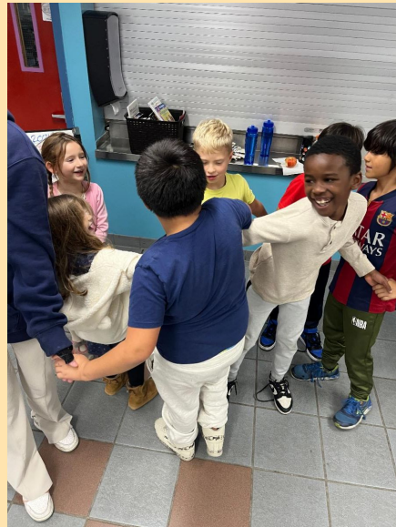
The human Knot challenge.