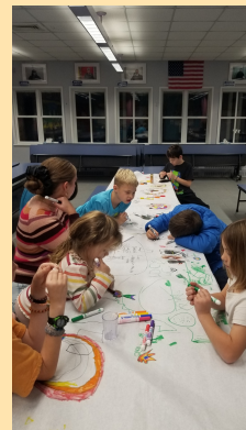
Ptown Theater! Movement