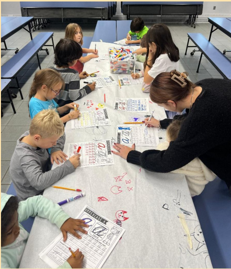
Learning how to write in cursive.